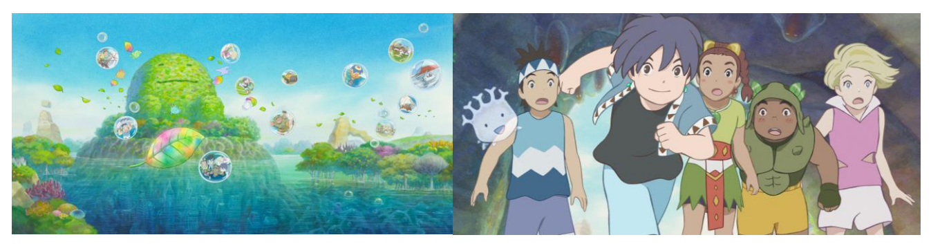
△"Tomorrow's Leaves" concept image

The animated film was produced through the Olympic Foundation for Culture and Heritage as an experimental effort to promote connections between sports, art, culture and education before, during and after the period of the Olympic Games. It was produced with vaunted Japanese animation technology, and features an original story that conveys the Olympic values of excellence, friendship and respect in ways that can be enjoyed by all, regardless of place, culture, language. Tomorrow's Leaves was produced by Studio Ponoc, the animation studio acclaimed for Mary and The Witch's Flower and Modest Heroes: Ponoc Short Films Theatre, Volume 1. By presenting the message of Olympism through the medium of Japanese anime culture to the many visitors who will enjoy the animation together with the night view from the TOKYO SKYTREE Tembo Deck, we will do our part to contribute to the success of the Olympic Games Tokyo 2020. Details can be found in the accompanying reference material.